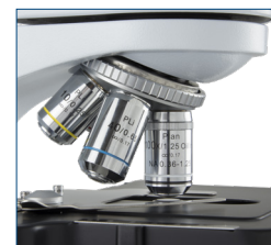
● S100x oil objective with built-in iris diaphragm

Revolving quintuple reversed nosepiece for max. five objectives