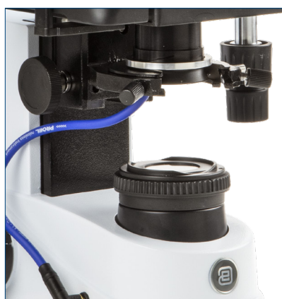
● Cardioid darkfield condenser with 5 W LED and integrated power supply