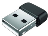
WiFi dongle ●

Suitable for all Euromex microscopes and most Zeiss, Leica, Olympus and Nikon models. See our adapters on our website